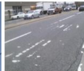
Bus lane as it looked on 12/5/14, only one year after implementation. Roadway markings are already worn out.