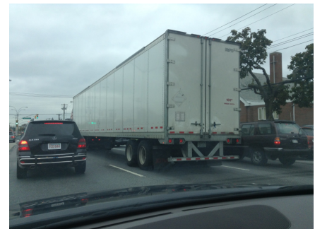
A tractor trailer on Cross Bay Blvd currently occupies virtually the entire lane.