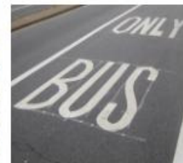
Bus lane as it looked when new.

This is how the bus lane sign appears to drivers making a right turn from Avenue Z into Nostrand Avenue. Signs are only placed on the corners so you will not see another one until the following intersection.